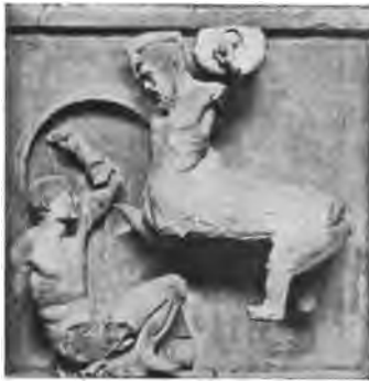
Fig. 8r. Centaur and Lapith.

ing and swore an oath of friendship. Soon after this Pirithoös celebrated his wedding and invited Theseus to attend. The Centaurs, who were also guests, becoming inflamed with wine, attempted to steal the bride. In the battle that followed Theseus fought bravely by the side of his friend Pirithoös and the Centaurs were driven off.